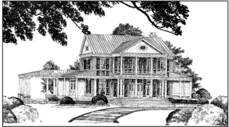
Built by Dixon/Kirby & Company of Cary, NC

The Southern Living Idea House is one of three 2003 showcase homes built to highlight the best in architectural and residential design. The Meadowmont home will be open to the public June 14 through September 28, and will be featured in the August issue of