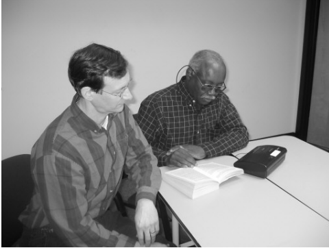
Using a tape recorder to strengthen literacy skills